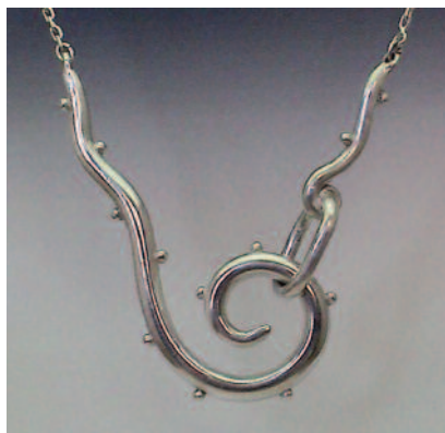
Angela Baduel Crispin (France) "Swing It" 2005 PMC, sterling chain.