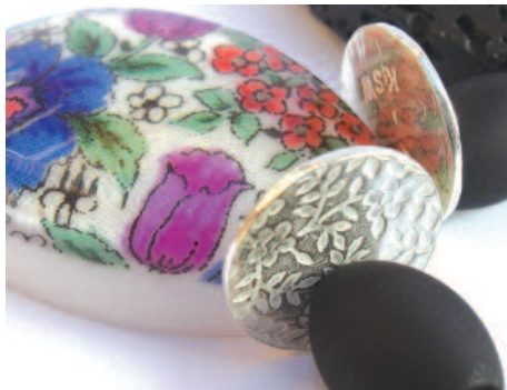
Detail: Resin & fabric beads with black volcanic lava and silver PMC beads.