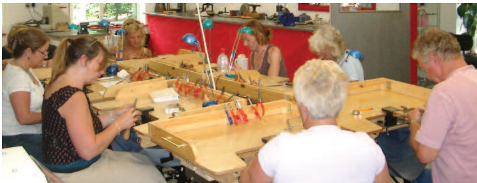
Students work on their PMC pieces in the purpose built jewellery workshop in Cornwall.